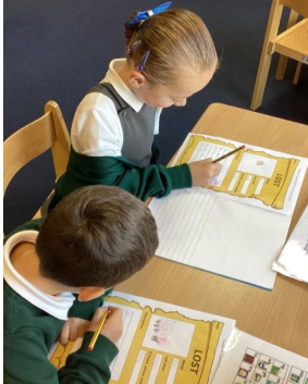
Year One have been writing a lost poster to help find their red toy bus which is lost in the woods. They have been using lots of interesting adjectives to describe the bus. If you see it, please let them know!

At Wellesbourne, we teach Writing through the Literacy Counts 'Read to Write' scheme. This empowers teachers to provide high-quality teaching of writing through children's high-quality literature (vehicle texts). The units of work centre on engaging, vocabulary-rich texts, with a wealth of writing opportunities. This approach allows children to develop their understanding of grammar through engaging and meaningful tasks.